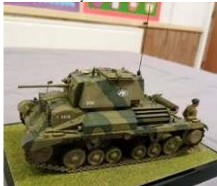
Kevin Curley A-10 Crusier Tank