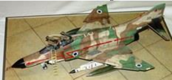
McDonnell Douglas F-4E Kurnass