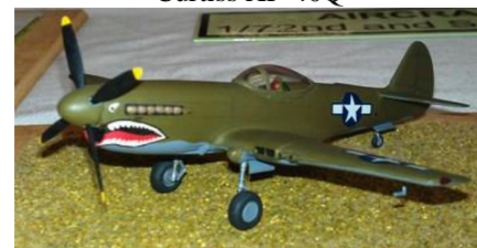
Curtiss XP-40Q