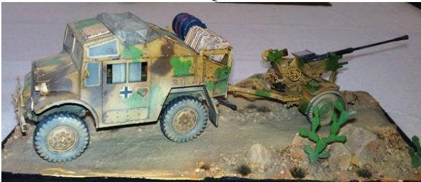
Mick Pitts Quad & 37mm Flak