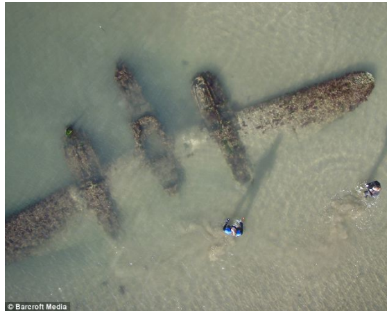
The P-38 'Maid of Harlech' crashed on the Welsh coast after both engines failed.

As you may be aware I'm a bit of a P38 lover and came across this on Christmas eve, Ok so I've got my eight grandkids around on the big day and that's good but THIS IS NEWS THE BEST CHRISTMAS PRESENT SO FAR!! Described as 'one of the most important WWII finds in recent history', the location of the Lockheed P38 Lightning has been kept a secret to keep the amazing find safe.